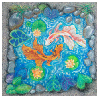
ArtFest 2023 Lehigh Senior High School Team #6 FIRST PLACE

Confirmation of team status will be sent via email to each student and their teacher by December 15, 2023